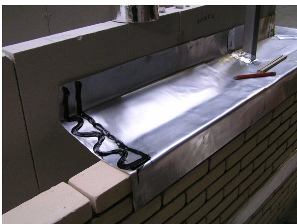
Connections Apply flexible (butyl) sealant between the overlaps.....