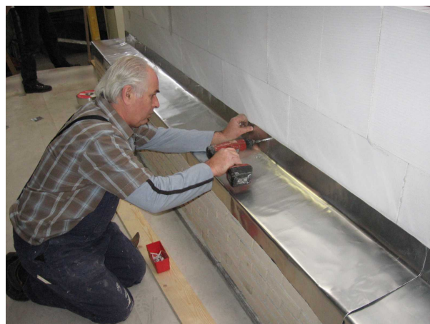
.....or fix direct into the wall with Hammerfix screw nails or SS fixings at 300mm centres.