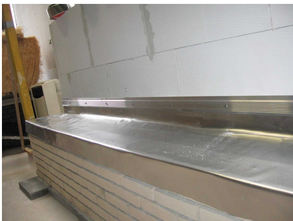
Fixation to the under surface. Use synthetic or SS steel strips.....