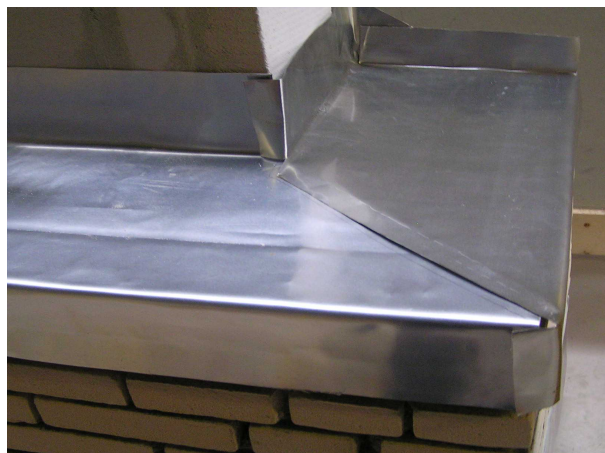
Bending / folding LACOMET® FL can easily be bent or folded.