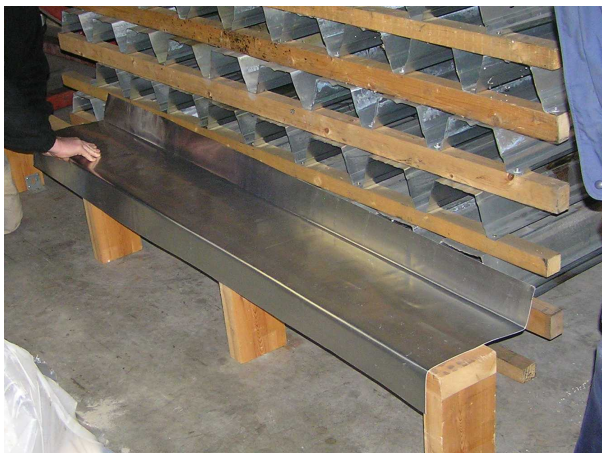
Cutting to size Lengths max. 3-4 metres.